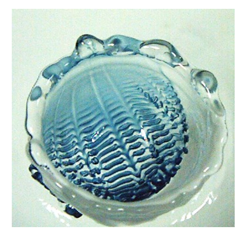
Regular flow structure of compound drop impact with water (Fluid Dynamics, 2024)